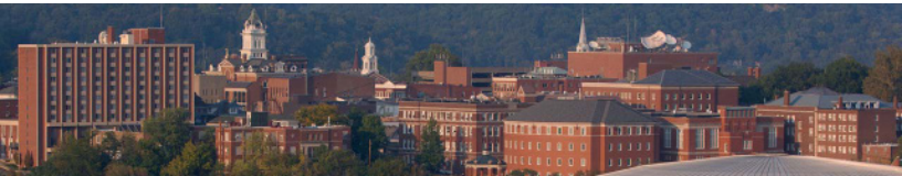
Tour of Athens highlights including Jackie O's, Dairy Barn, Kennedy Museum, and concludes at the King Midget display at the Athens Historical Museum.